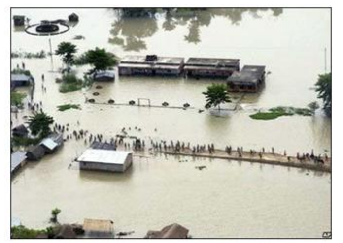
Bihar Flood 2009