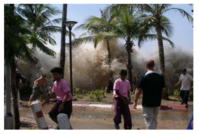
Tsunami of 2004

Though, the forecasting, monitoring and warning mechanisms are beautifully articulated on paper in practice, the warnings are not early enough and they do not reach all those likely to be affected. In case of Tsunami, 2004; Bhuj earthquake etc for example, communication facilities which could have resulted in better co-ordination of warning and reduction of damage to life and property were inadequate.